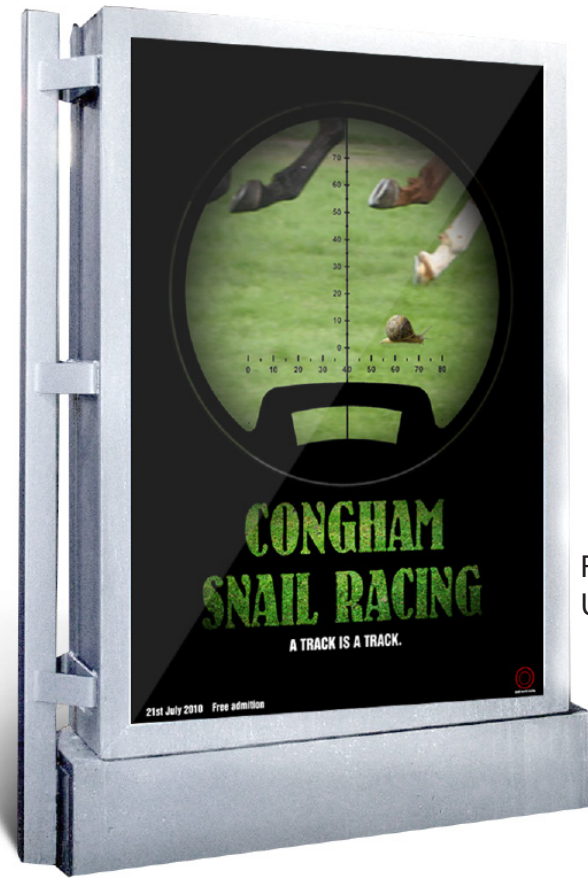
Festival Campaign University project