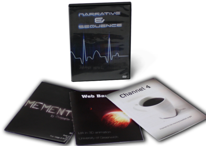
DVD motion in graphic University project