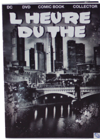
Comic book University project