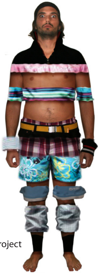
Brand me University project